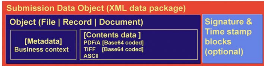
Figure 2: Submission Data Object

A valid submission data object (SDO) is a self-contained XML data package, structured according to a valid and authorized XML schema. Besides the version information and the statement of the assigned XML schema, such a submission data object comprises in the simplest case two self-describing data blocks which include the contents data (primary information) and the accompanying business context. Optionally, one or several signature and/or time-stamp blocks are also included (see Figure 2).